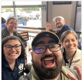
SWDAA BOD LUNCH SELFIE