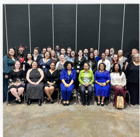
SWDAA BANQUET PIC