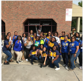
SWDAA TBS MEMBERS