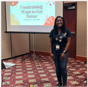
FUNDRAISING WORKSHOP HOSTED BY CIARA