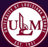
Tau Beta Sigma: Delta Sigma Chapter