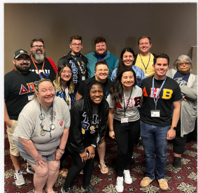
SWDAA MEMBERS WITH SWD ACTIVE COUNCIL