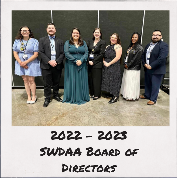
2022 - 2023 SWDAA BOARD OF DIRECTORS