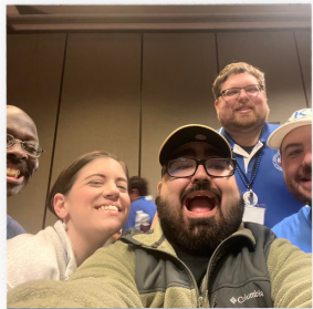
SWDAA SELFIE WITH KKPSI AABOD