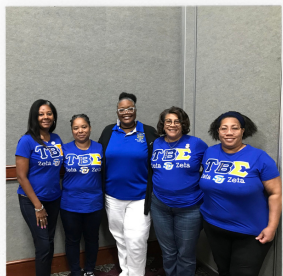
TBS ZETA ZETA ALUMS