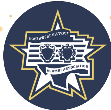
Open Programs Director